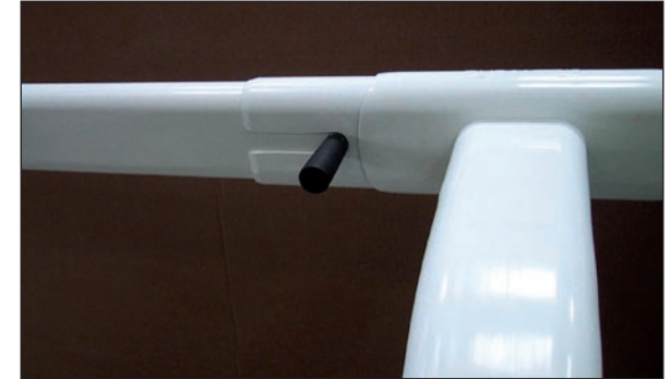
T-CONNECTOR - UNDERSIDE