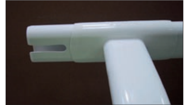
T-CONNECTOR - UNDERSIDE